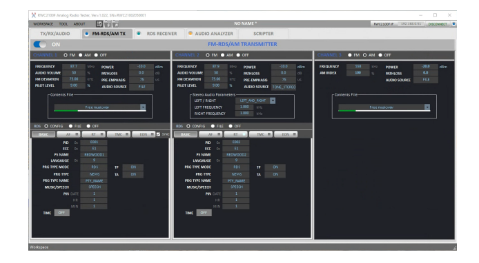
[FM-RDS / AM]